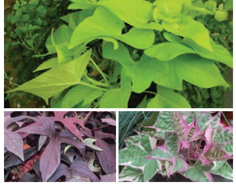
SWEET POTATO VINE